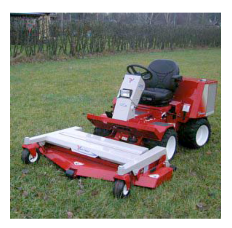
YOUR GIFTS AT WORK . . .

The CNY Community Foundation (Fenstermacher Fund) granted $6,000 which the Board spent on road repair, tree removal, and grave marker repair. The Cortland Community Foundation added $8,000 to the road repair fund.