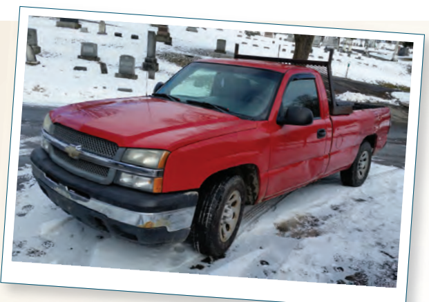
CRC'S NEW RIDE!

Sometimes, out of the blue, an Angel will descend upon your day unannounced, unsolicited, and uninterested in acclaim for their generosity. In this case, the great folks with big hearts at Cortland's own Economy Paving Co. donated this much-needed, lightly used pickup truck to the CRC — just as our current one (itself an appreciated donation from the town of C'Ville, a few years back) was on its last legs. We cannot thank Steve Compagni and Economy Paving enough for this gift! We're already putting it to good use transporting materials, prepping gravesites, leading funerals, and more.