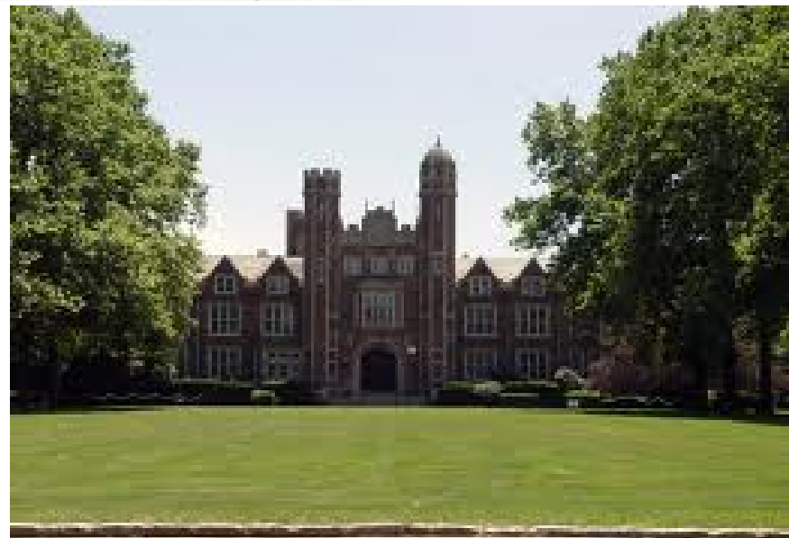
Main Hall, as it appears today