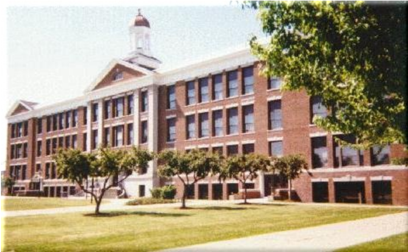
Cortland Central School at 60 Central Avenue (currently Cortland County Office Building) in Cortland, NY