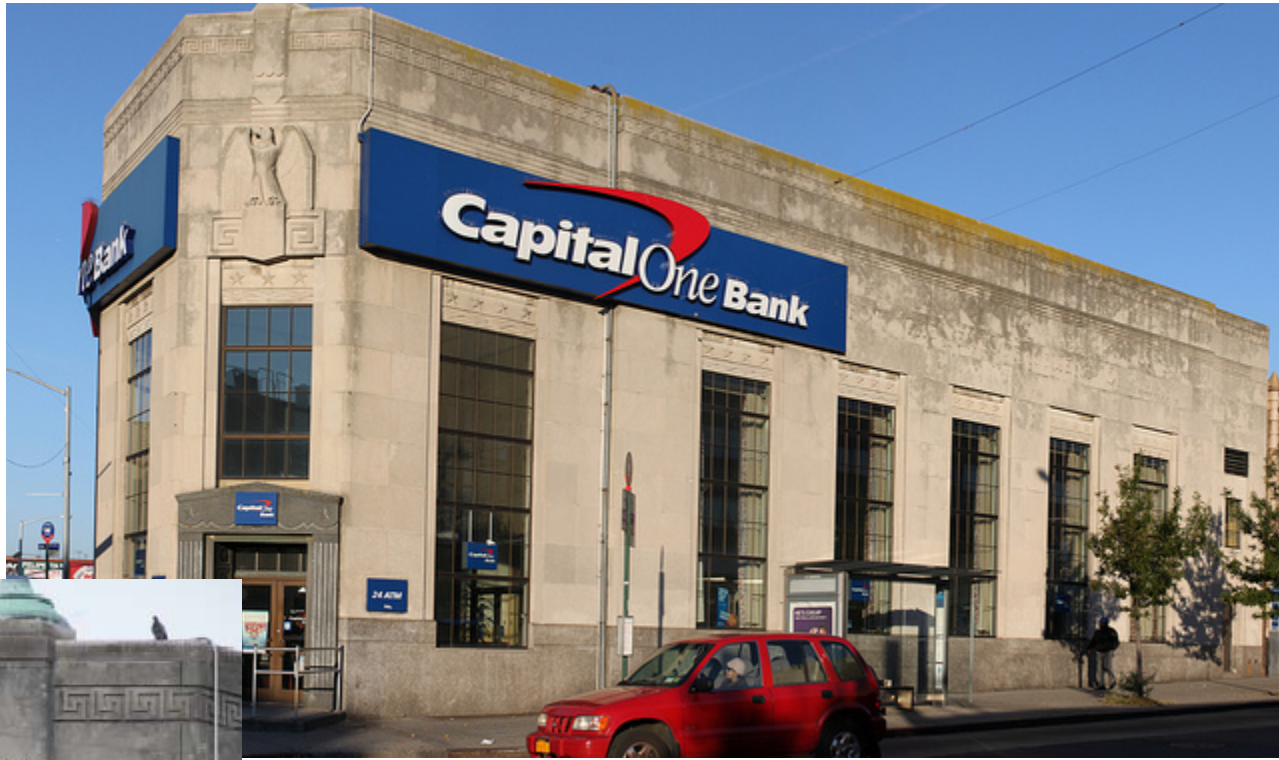
Jamaica Avenue, Jamaica, Queens, New York City