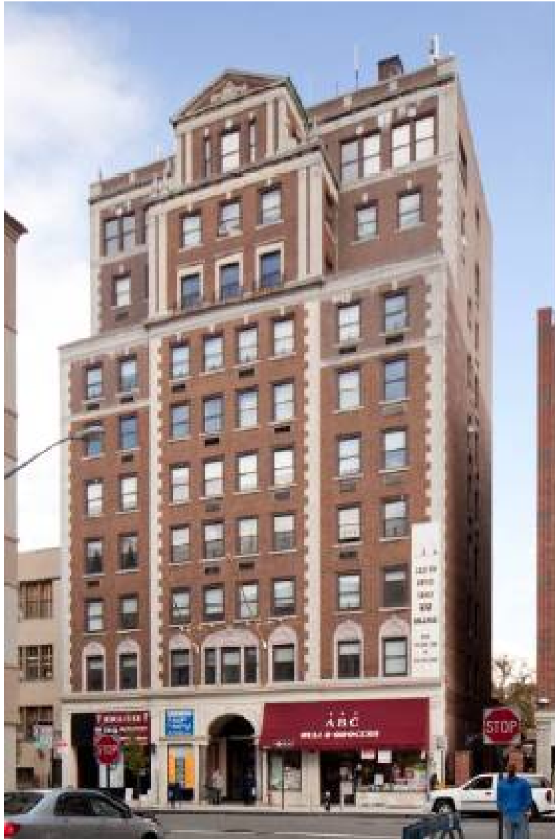
The Jamaica Chamber of Commerce Building was constructed in 1928-29 near the heart of the Jamaica, NY business district.