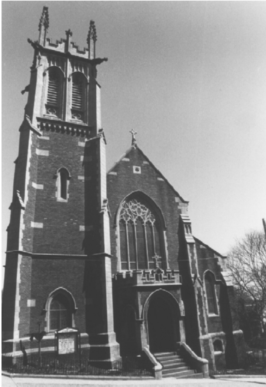
Trinity Evangelical Lutheran Church 309 St. Paul's Avenue Staten Island, N.Y. 10304